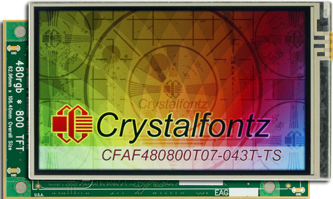
CFAF480800T07-043T-TS TFT display shown with CFA10057 mother board. CFA10036 not shown.

CFA920-TS is an assembled product that contains: