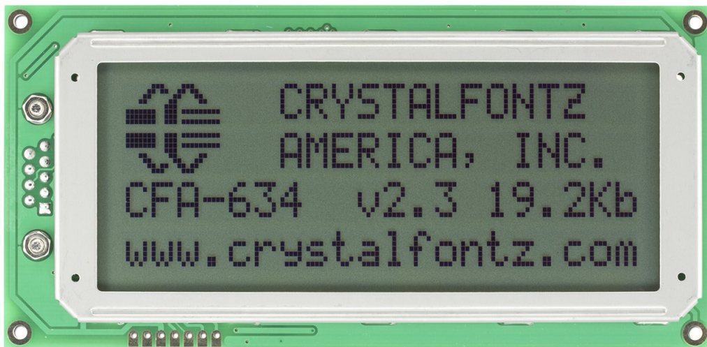
New wide temperature CFA634