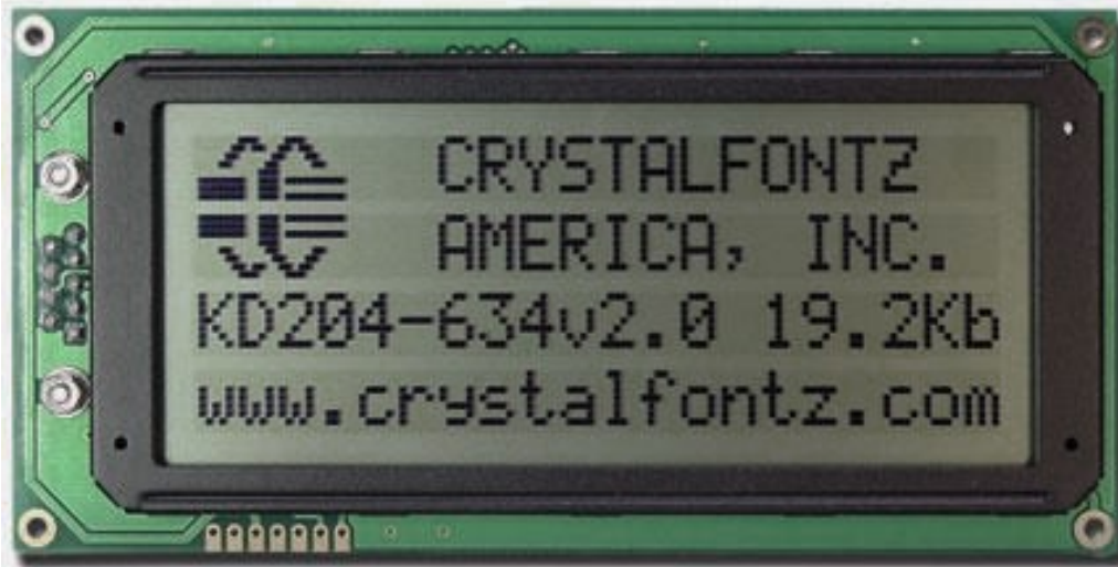
Old standard temperature CFA634

Visual differences between new wide temperature CFA634 and old CFA634 hardware: